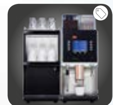
Regular Capacity Cup Warmer with Integrated Milk Cooler