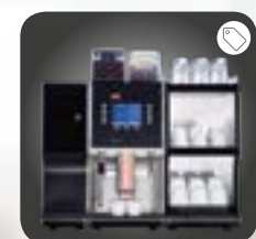
Large Cup Warmer / Milk Cooler